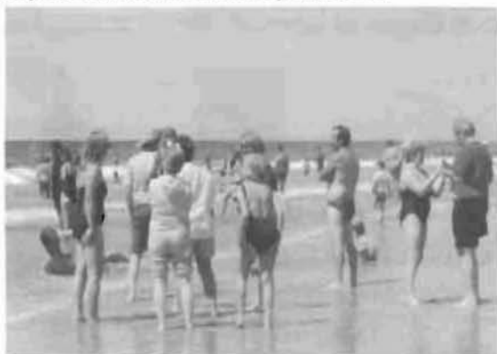
(Enjoying the sun, sea and sand)

There were plenty of chances to relax, to improve ones' French and to cement the wonderful friendships that continue to grow during each visit. We will always remember the giant paella for one hundred people at the dinner-dance held in the Saint-Threnody church hall; our indoor pique-nique which was held in the local sports club – owing to heavy showers – but perhaps most memorable of all, sharing meals and the hospitality offered in their homes by our hosts.