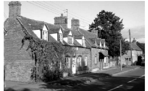
An abnormally peaceful High Street