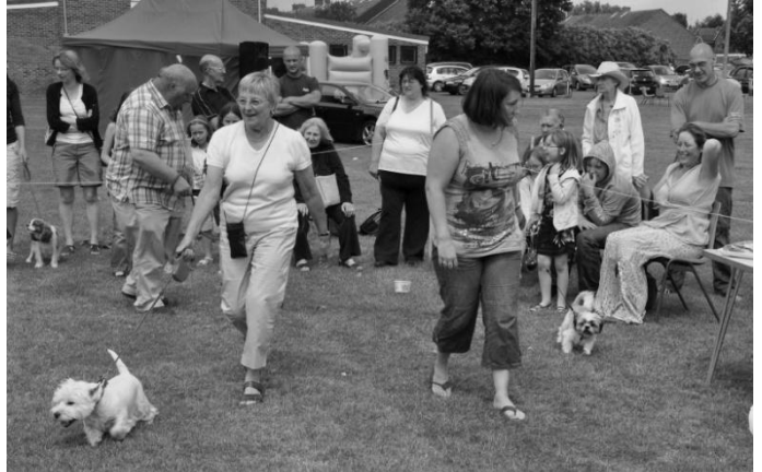
Proud owners line their pets up for the Prettiest Bitch Competition