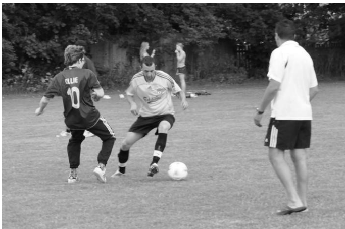
Some of the footballers in action