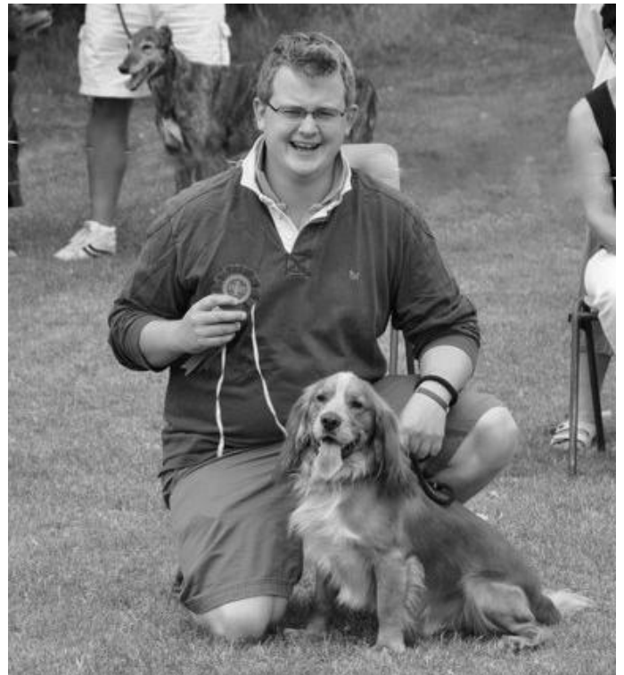
Oscar the Spaniel won both the Handsomest Dog & Waggiest Tail Competitions