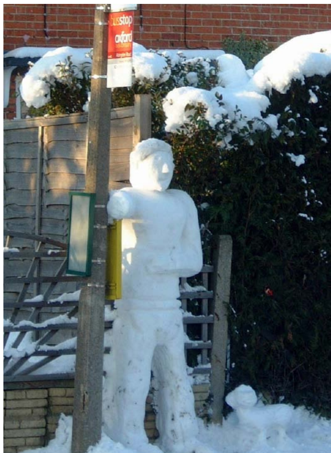
A Commuter in the recent snowfall demonstrates that Drayton really needs that extra bus shelter . . .

Inconvenient it might be For older folk like you and me; But when all is said and done The kids are having so much fun, When old, nostalgically they'll then Remember winter twenty ten.