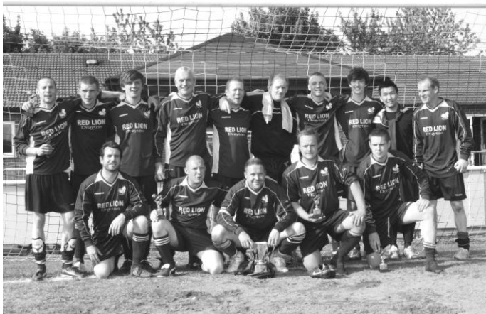
The victorious Drayton Reserves side pictured after winning The Nairn Paul Cup at Abingdon United on Saturday 30th April. Our thanks must go to Members of Drayton Wasps under 11s, who did a fantastic job as ball boys on the day (Picture including the Wasps under 11s on Page 3)