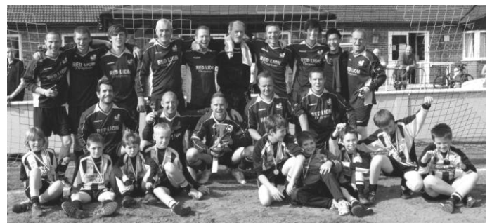
Picture carried over from the football item on page 1, showing members of the Drayton Wasps under 11s who acted as ballboys in the final of the Nairn Paul Cup