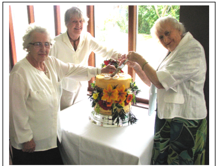
From page 3 (Drayton Wives) here are the three Founder Members cutting that wonderful celebration cake!