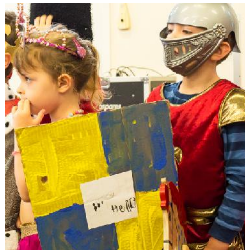
These are 2 of the day's 'Knights & Princesses'

(& there follows some pictures of the day :-)