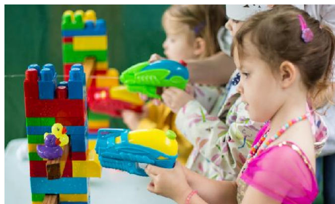
And THIS is 'squirt the duck'!!