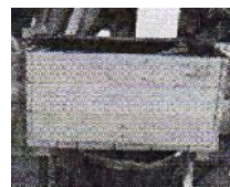
9"x 9"x18" £20