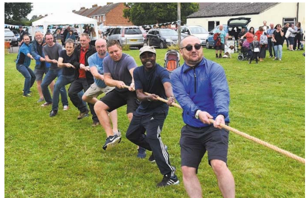
The men lost today so what about tomorrow?

But this I know when winter's come And hands and feet and ears are numb, When rain pours down and skies are grey And there's no sun day after day, Then with nostalgia I will yearn For the heatwave to return!