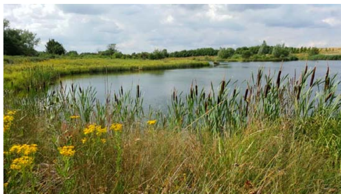
A view across 'Drayton Lake' this summer