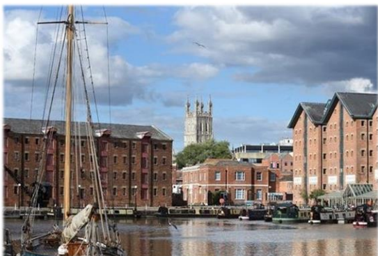
(Editor: Prior to living in Drayton I lived in a flat in Gloucester Docks Victorian Basin with this view)

Off we went feeling refreshed to Gloucester Quays which has something for everyone. A good outlet village for shoppers, lots of museums and wonderful historic docks.