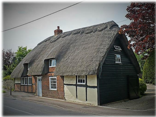
15th Century Cruck Cottage

Two sites of former settlements in the parish are scheduled monuments. One is about ½ mile (800 m) north of the village at Sutton Wick, overlapping the parish boundary with Abingdon. The other is around Brook Farm about ½ mile (800 m) southeast of the village.