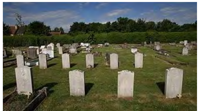
A group of 1950s Commonwealth War Graves Commission RAF graves in Abingdon New Cemetery, including seven victims of the Sutton Wick crash

https://en.wikipedia.org/wiki/Sutton_Wick_air_crash