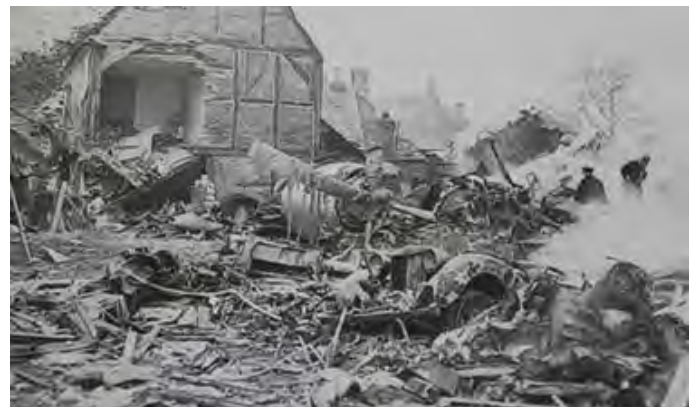
The crash site of XH117 shortly after the accident.