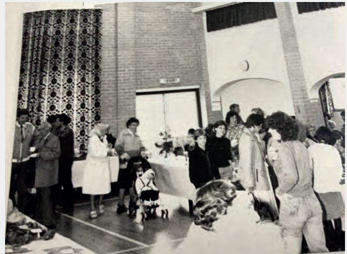
WI 'Grow, Cook and Sew' Show