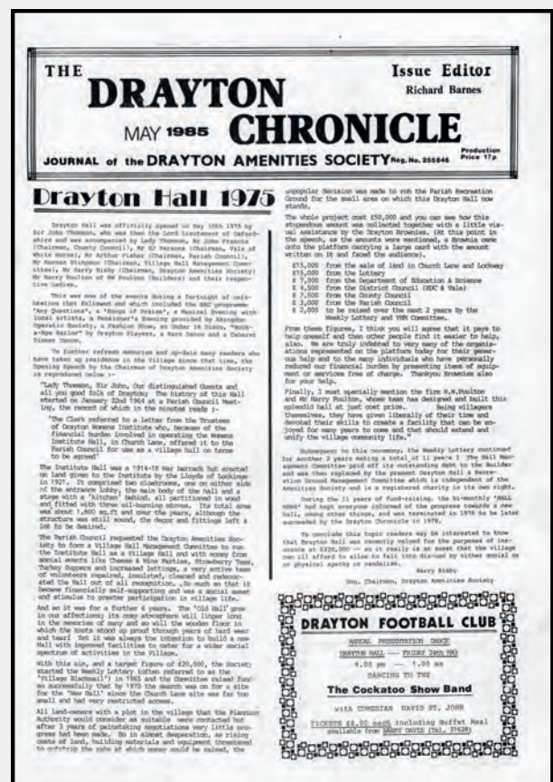
Front page of the 1985 Chronicle celebrating 10 years of the hall